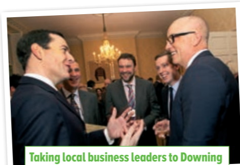
Taking local business leaders to Downing Street to meet the Chancellor to celebrate their success and raise concerns.

Late last year, I was disappointed to learn that the local bid for a new Enterprise Zone on the boundary between Corby and East Northamptonshire had not been successful, after months of enthusiastic lobbying in the House of Commons in support of it.