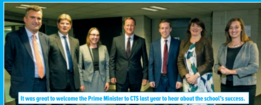
It was great to welcome the Prime Minister to CTS last year to hear about the school's success.

Pupils at the school had the opportunity to put their questions to the Prime Minister and it was a great opportunity for him to see the results of the fantastic work local teachers, parents and students have put in to make CTS an 'Outstanding' school. The announcement of the new free school also demonstrates the Government's commitment to investment in Corby and I am delighted that it will deliver additional school places, along with greater choice for parents. I have also kept up the pressure for fairer funding for schools in our area, after years of underfunding under successive governments, and I am pleased Ministers are taking action to put this right.