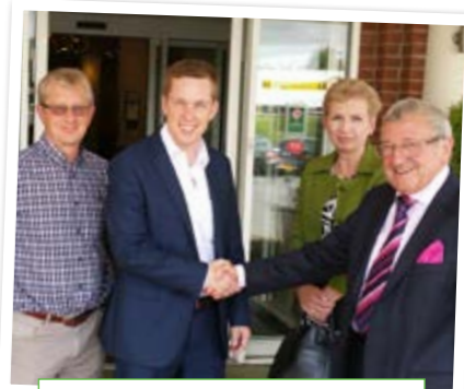
Supporting our local magistrates in the fight to keep Corby Magistrates' Court open. Unfortunately, our efforts were unsuccessful.

Our police have been chronically underfunded over many years, relative to other areas, and this year, we have seen a number of changes to police funding, something I have lobbied the Chancellor of the Exchequer and Home Secretary on.