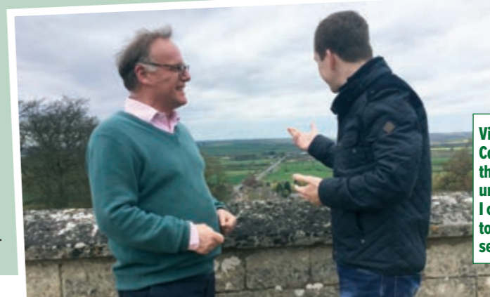
Visiting Rockingham Castle to see this jewel in the Corby crown and to understand the business. I continue to help fight to protect stunning rural settings such as this.

Whilst I will always press for more police officers out on the beat, catching criminals and deterring crime, I have been impressed by the forward-thinking work that Northamptonshire Police have been doing, particularly to help reduce rural crime - as we all know, crime crosses county boundaries and tackling it must be achieved through coordination with neighbouring forces. I am also pleased to receive regular updates from the local policing teams, along with the organisations they work closely with to tackle crime – for example, the Corby JAM project, which has done incredible work over many years in the town to drive down antisocial behaviour.