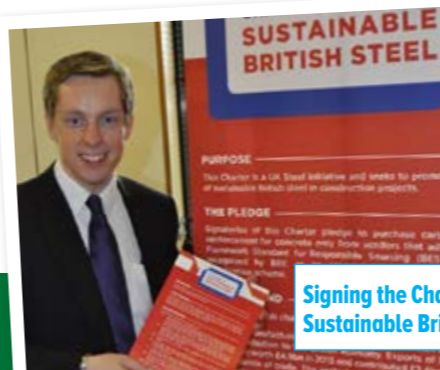
Signing the Charter for Sustainable British Steel.

Following the announcement that Tata Steel were selling their UK operations back in March, I hand-delivered a letter to 10 Downing Street urging the Prime Minister to intervene urgently to ensure the Government played a full role in helping to convene discussions, with a view to identifying a strong and sustainable future for Tata's sites, including Corby – ideally identifying a buyer, rather like Tata purchased Corus' portfolio of sites back in 2007.